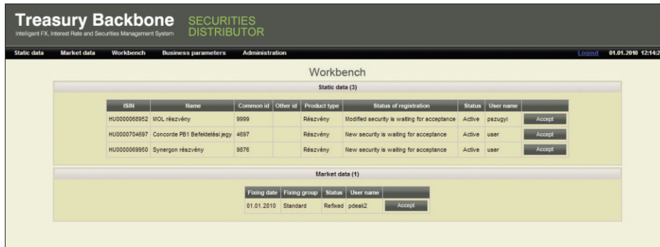
Figure 4: Personal Workbench: The approver can accept or decline any changes to static or market data